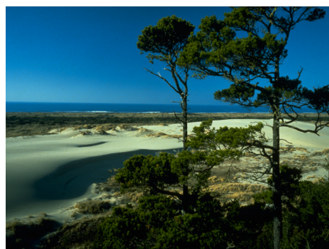
Above: Coastal barriers are important for migratory birds and many at-risk plants and animals.

Keeps people out of harm's way by discouraging construction in risky areas where hurricanes strike first.